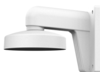
DS-1273ZJ-135 Wall mount