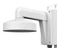
DS-1273ZJ-135B Wall mount with Junction box