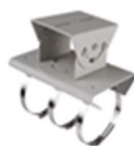
DS-1214ZJ Horizontal pole mount