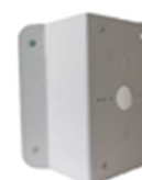
DS-1276ZJ Corner mount