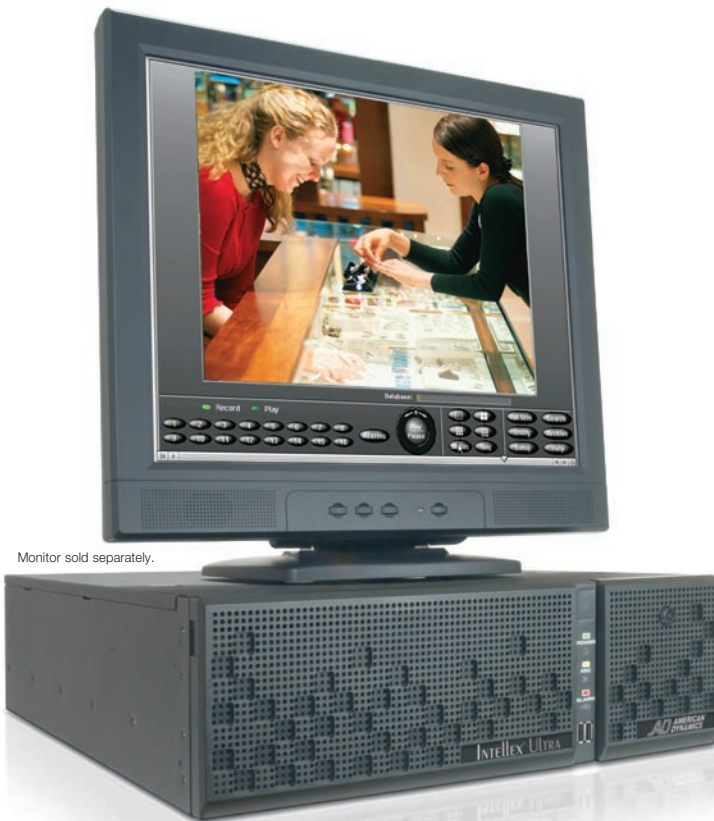
Monitor sold separately.