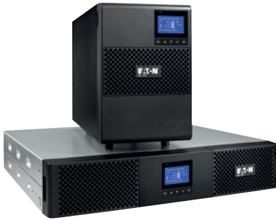
9SX Rack & Tower models