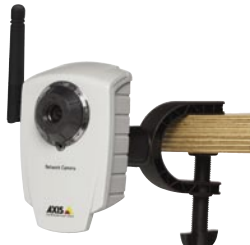
AXIS 207/207W/207MW Network Camera with flexible clamp - clamp included