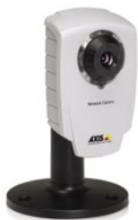
AXIS 207/207W/207MW Network Camera with camera stand - stand included