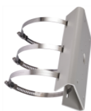
DS-1275ZJ Vertical pole mount